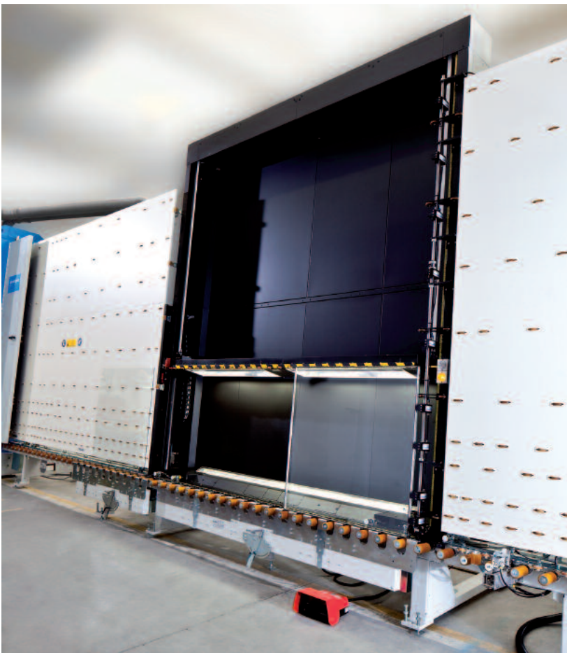
Automatic adjustment of frame positioning girder according to present glass thickness